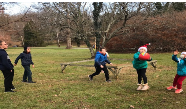
Outdoor fun from the Parents' Morning Off