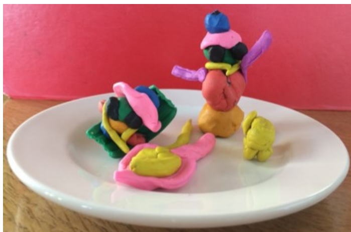
A sculpture on the theme of Growing Up in the Meeting

At the rise of worship there will be a time to discuss Friends' experience of the time together in worship this morning, and announcements.